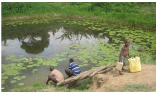
Children fetching water for home use. It is unfortunate that clean water is not easily accessed in a big part of the country