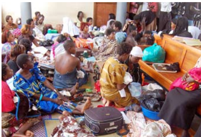
Patients sleeping on the floor in the wards of Mulago National Referral Hospital