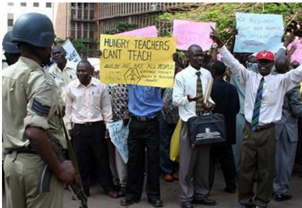
Teachers in Uganda on strike over poor pay

In addition, for those who have already retired, my government will ensure that their pension funds including arrears are promptly paid to their accounts in accordance with the law.