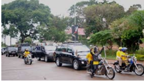
President Museveni's normally moves in a convoy of over 40 vehicles to have his security guaranteed. The Ugandan tax payer bears the burden of maintaining this convoy