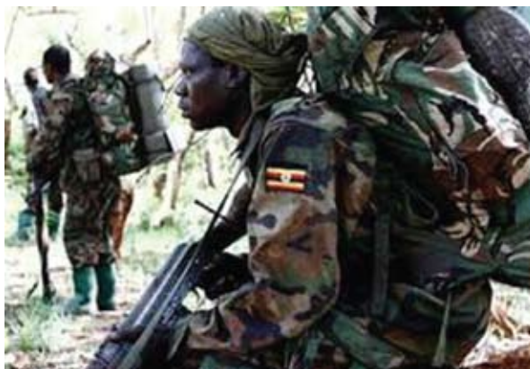
Soldiers of Uganda Peoples' Defense Forces troops pictured in South Sudan in February 2015. The troops were allegedly deployed to South Sudan before consent of the Ugandan Parliament

promote sub-regional and regional integration and cooperation emphasizing intra-African trade as the cornerstone for Africa's socio-economic and political unity. Through economic diplomacy, my government will strengthen and consolidate its trade and investment links with regional partners while exploring new trade and investment partners in order to expand access of Ugandan products to foreign markets, while at the same time increasing investments for our country.