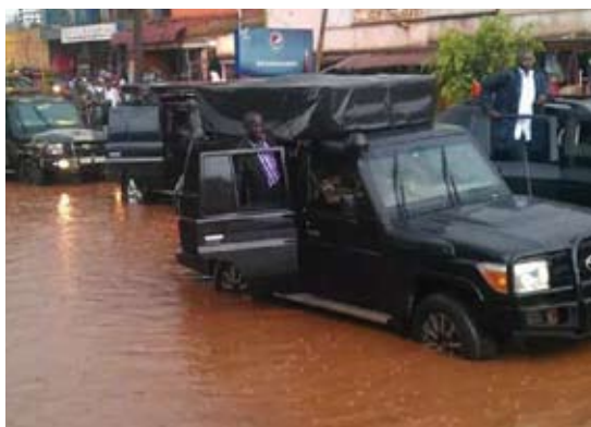
Thank God President Museveni's convoy got a feel of the floods which often characterize heavy downpours in Kampala.