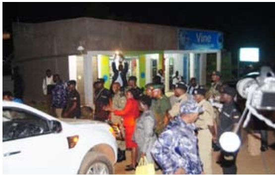
Inspector General of Police, Kale Kayihura, visits a crime scene after a murder of a prominent lawyer in Kampala. There has been a high rate of murders and crime in suburbs in Kampala and upcountry causing a lot of insecurity among citizens