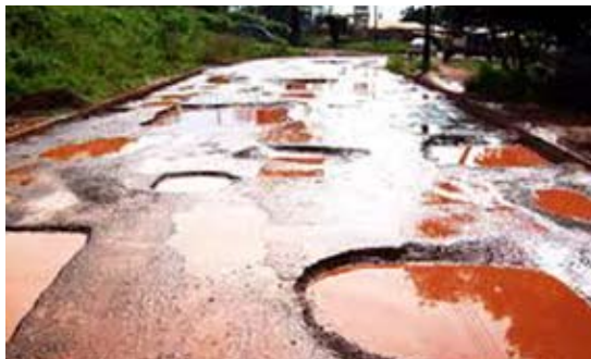
Accidents are inevitable with such pot-holed roads in Uganda