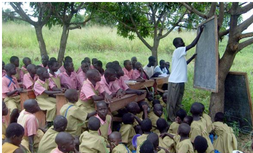
Students undertaking classes under a mango tree. One wonders what happens to such classes in cases of rain!