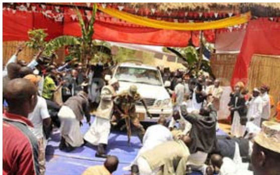
Kabaka Ronald Muwenda Mutebi of Buganda Kingdom makes a triumphant entry into Kayunga district. Just like religious leaders, cultural institutions have unquestionable influence over their subjects